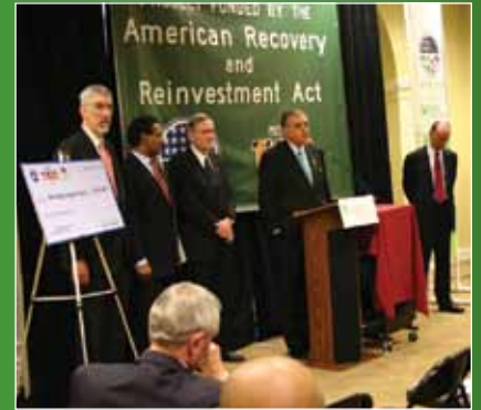
U.S. Secretary of Transportation Ray LaHood visited the Green Impact Zone office to announce a grant that will fund transportation and infrastructure improvements in the zone.

LaHood called the zone a great model for environmentally friendly urban-growth projects in other parts of the country.