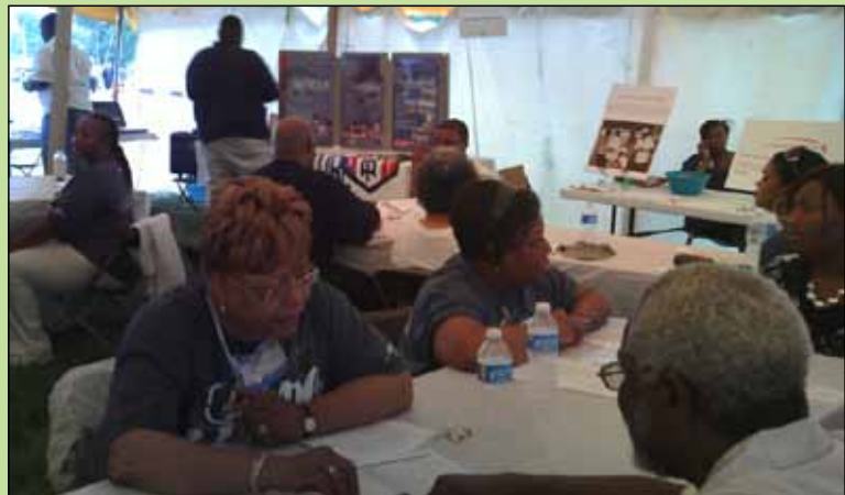
Green Impact Zone ombudsmen, volunteers and partner organizations help zone residents apply for needed services from a multitude of assistance programs. A common application will greatly simplify the process.

The non-residential survey quantifies conditions of business properties, including structures, driveways, parking lots, sidewalks, landscaping, litter and more.