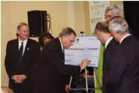
Secretary Ray LaHood signs a ceremonial check representing the $50 million TIGER award to the Kansas City region.